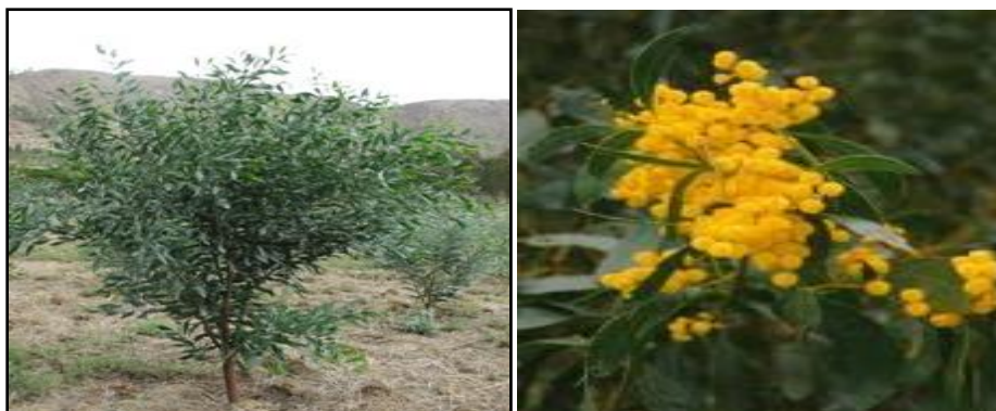
Photo. 1. Acacia saligna tree/ shrub.