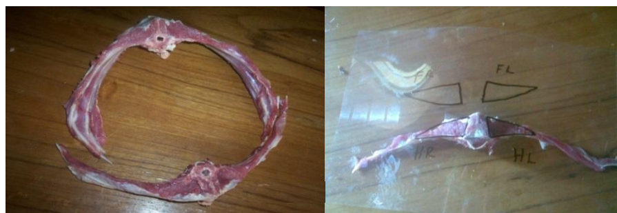
Photo 2. Rib eye muscle area.

Therefore, DP was calculated as the proportion of HCW or EBW / SBW.